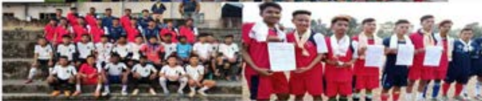
Friendly football tournament between Gorubathan Govt. College vs Judhvir High School