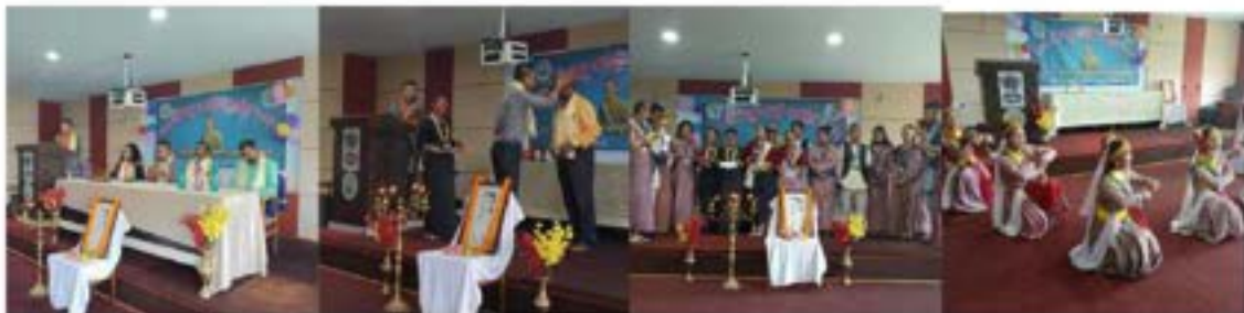
208th Bhanu Jayanti Celebration organized by Cultural Committee, Gorubathan Govt. College