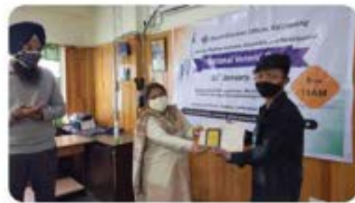
Students participation in online debate competition and essay competition