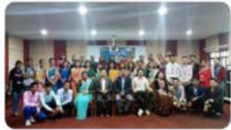
Seminar organized by Department of Nepali